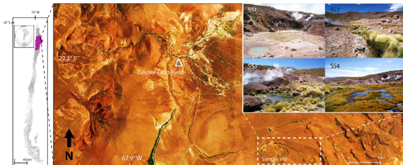
Figure 1. Location and Sampling sites showing the platform of the Project Geothermic El Tatio

Sediments or water were placed in sterile flasks containing 12 mL of CDM medium (2% wt/vol) (Muller, 2003) supplemented with 5 Mm of As(V) and incubated at 25 \pm 2 °C for 48 h. Enrichment cultures were centrifuged at 5000 rpm for 15 min, washed twice with sterile deionized water and spread onto a new As(V)-supplemented CDM agar (2%) at 28 \pm 2 °C for 10 days in the dark. The bacterial isolates were submitted to different experiments.