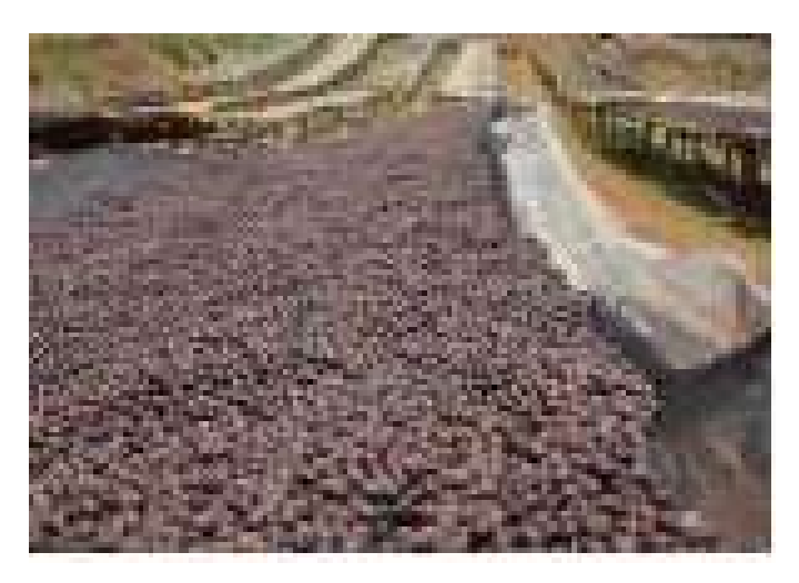
Fig. 3. Sun drying of coffee for dry process

In dry method, the coffee cherries are dried immediately after harvest. This is usually sun drying on a clean dry floor or on mats. The bed depth is less than 40 mm and the cherries are raked frequently to prevent fermentation or discoloration. However, there are problems associated with this method. The most serious problem is dust and dirt blown onto the product. Another problem is rainstorms often appear (even in the dry season) with very little or no warning. This can soak the product very quickly. Labor has to be employed to prevent damage or theft. Sun drying is therefore not recommended. The dried cherry is then hulled to remove the pericarp. This can be done by hand using a pestle and mortar or in a mechanical huller. The mechanical hullers usually consist of a steel screw, the pitch of which increases as it approaches the outlet so removing the pericarp.