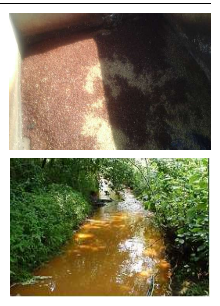
Fig. 4. Waste disposal

Agro-industrial residues/wastes are generated in large quantities throughout the world. Their non-utilization results in loss of valuable nutrients and environmental pollution.