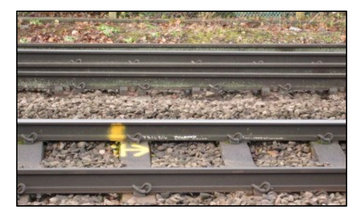
Fig. 4.Continuous welded rail (Jones & Ashby, 2019b)

The Continuous Welded Rail (CWR) technique is employed to connect rail segments seamlessly to create a continuous track without any gaps or joints. With CWR, the individual rail sections are welded together, forming a single, uninterrupted rail that can extend for several miles. This is in contrast to traditional railroad track construction, where rail segments are connected using fishplates or joint bars. These jointed tracks allow for some flexibility and movement to accommodate temperature-related expansion and contraction.(Jones & Ashby, 2019a)