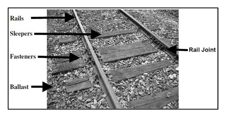
Fig. 3. Traditional railway track with joints http://www.railjoint.com/news/rail-track-components.html