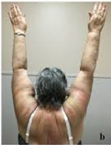
Fig 4. Post of range of motion after 3 months