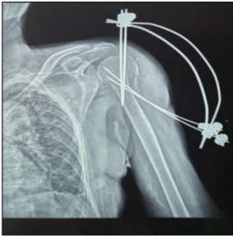
Fig. 3. Postop of Proximal humerus fixator