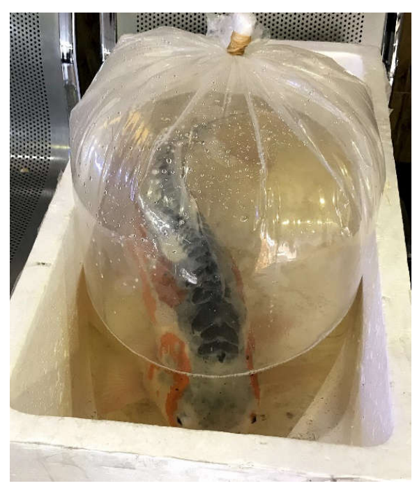
Figure 2. Transporting the fish using original water of the tank in the bag