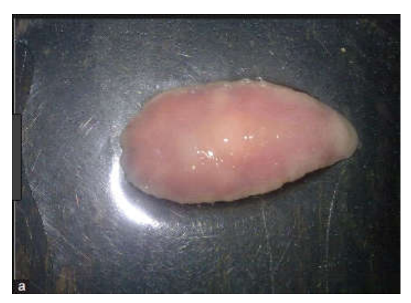
Figure 2 a. Adult F buski (Dorsal view)

cortical surface of right kidney, Multiple tiny cysts were seen diffusely in both lobes of liver, largest one measuring 1.7 cm at segment VII of right lobe of liver (Figure1). During evaluation of her stool sample, stool showed multiple eggs with moving live parasites which were later confirmed to be Fasciolopsis buski (Figure 2 a & b). She was diagnosed as a case of fasciolopsiasis and was successfully treated with praziquantel and iron supplementation.