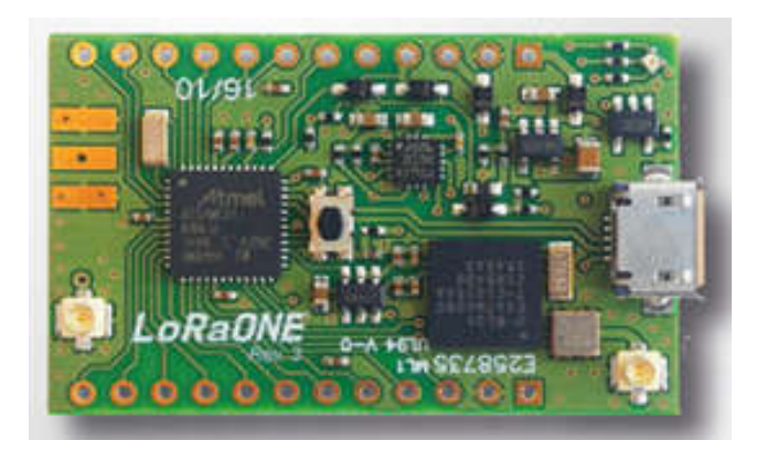
Figure 2. LoRa board

LoRa: Long range, low power wireless well-known technology choice for building IOT networks worldwide. Smart IOT applications improved the way we interrelate and are addressing some of the biggest challenges facing cities and communities: climate change, pollution control, early counsel of natural disasters, and saving lives. Businesses are benefit too, through improvements in operations and efficiencies as well as drop in costs. This wireless RF technology is being included into cars, street lights, manufacturing equipment, home appliances, wearable devices – anything, really. LoRa Technology is making world a Smarter.