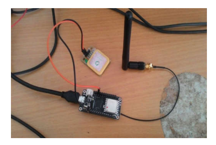
Figure 3. working of lora

A Semitic innovation, LORA Technology offer a very convincing mix of long range, low power consumption and secure data transmission. Public and private networks using this technology can provide exposure that is greater in range compared to that of existing cellular networks. It is easy to plug into the live infrastructure and offers solution to serve battery BASED ONIOT applications. LORA Technology into its chipsets. These chipsets are then built into the products offered by our enormous network of IoT partners and integrated into LPWANs from mobile network operators worldwide.