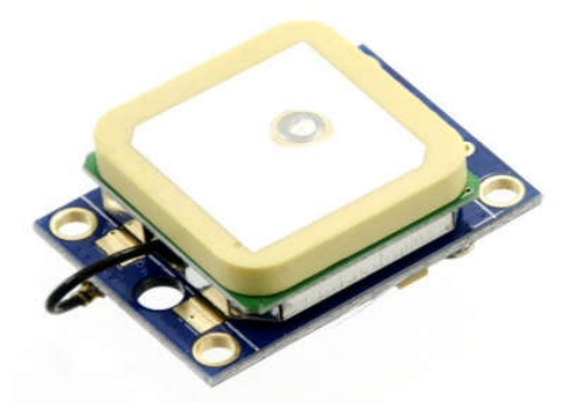
Figure 4. Global Positioning System