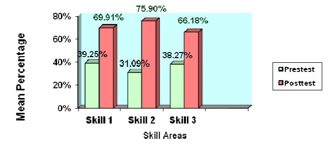
Fig. 2. Bar diagram on mean percentage pretest and posttest skill scores of the high school children

The skill scores of 'first-aid for bleeding wounds' of school children showed that the mean posttest scores (8.39) is higher than that of mean pretest scores (4.71). The skill scores of 'first-aid for closed fracture of the hand' of school children showed that the mean posttest scores (8.35) is higher than that of mean pretest scores (3.42). The skill scores of 'first-aid for poisonous snake bite' of school children showed that the mean posttest scores (7.28) is higher than that of mean pretest scores (4.21).