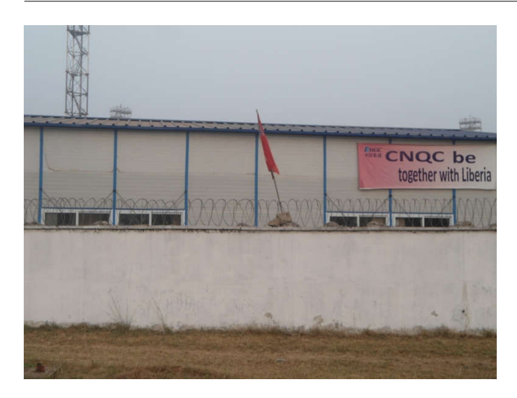
Figure 7. Rear view of the China ETU at the SKD Sports Complex