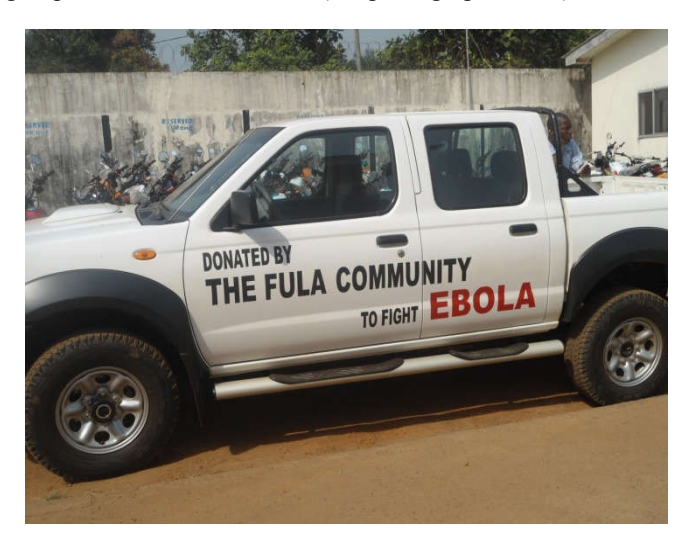
Figure 2. A vehicle donated by the Fula Community (a tribal group) for use by the National Taskforce in the fight against Ebola

buildings, public buildings, vehicles, etc. As a result of persistent and continuous public awareness activities, the state of denial no longer exists. Below is a public bus stop that carries many Ebola awareness messages for public consumption. Donations from all walks of life in cash and kind created a good atmosphere and a balance to effectively fight the disease. Donations came from the international community as well as local groups, local banks, individuals and the like. One of such is the donation by a local tribal group who donated a vehicle (see photograph below).