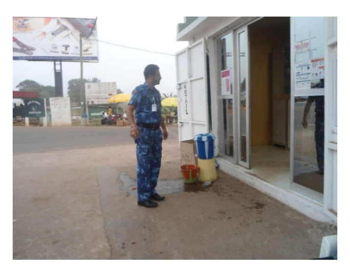
Figure 12. United Nations military personnel seen immediately after washing his hands to enter a pharmacy store in Monrovia