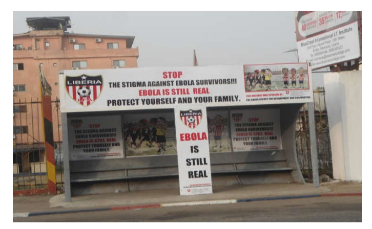
Figure 1. Ebola awareness messages on a bus stop along the major street leading to the city of Monrovia from the Roberts International Airport (RIA)

There are several success stories to be told to date regarding the fight against the EVD. Currently, there are close to one thousand (1000) registered survivors that were admitted into the Ebola Treatment Units (ETU), tested positive, given supportive treatment and later discharged because they were tested negative at least twice after the supportive treatment. Many of these survivors are kids whose parents lost their lives to the EVD. In the absence of defined treatment protocol, many persons have survived from the disease as a result of the many strategies put in place to fight against the disease. One of such examples is the child survivor, only named Patrick, below.