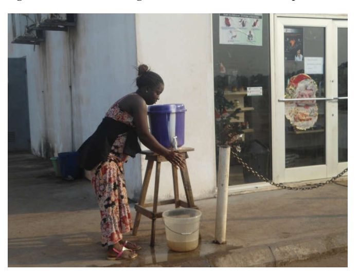
Figure 11. A lady was seen washing her hands before entering the supermarket

Community involvement and support in the fight against the disease has proven very well. All communities are involved in mobilization, contact tracing, reporting about deaths and sick people in communities and the like. The community involvement has helped to establish a communication chain from the individual level, to family level, to Ebola call center and finally to the treatment unit. Community leaders have taken charge; and they usually play a very significant role in community health awareness and education. Currently there are ten (10) testing centers available in the country as opposed to only one (1) center at the onset of the crisis. availability of more testing centers has solved the problems of uncertainty and delay in the provision of supportive treatment. Empowerment / Capacity Building –training of health workers and improved logistical arrangements have improved the management of the disease and general healthcare delivery services.