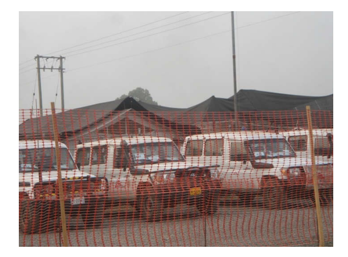
Figure 6. Partial view of the MSF run ETU with several ambulances parked at the entrance

The IMS is headed by Hon. Tolbert G. Nyenswah, who served in the Ministry of Health and Social Welfare as Assistant Minister for preventive services. Hon. Nyenswah provided some basic information that gave additional substance for the development of this article.