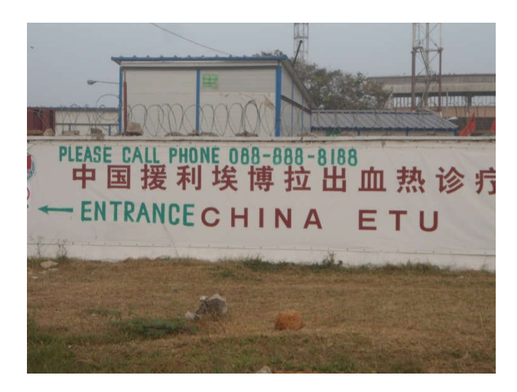
Figure 4. China ETU constructed in Samuel K. Doe (SKD) sports complex compound; it is being run by Chinese health professionals. It is the latest ETU to be dedicated

The construction of Ebola Treatment Units (ETU) around the country helped solve the problem of no bed space which initially led to rejection of patients and many deaths. Monrovia city (in Montserrado County) and its environs hosted up to six (6) Ebola Treatment Units. At least one (1) ETU was constructed in each of the other fourteen (14) counties. Initially, nine (9) ETUs were constructed in six counties outside of Montserrado County, with Margibi County receiving three (3) of the ETUs. Below are photographs of some of the ETUs. The establishment of the Incident Management System (IMS) with a clearly defined command structure improved coordination and service delivery.