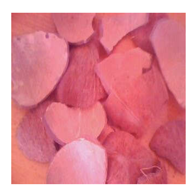
Plate V. Coconut shell before crushing