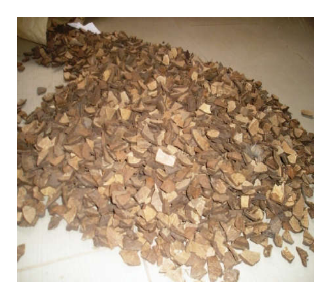
Plate VI. Machine crushed Coconut shell