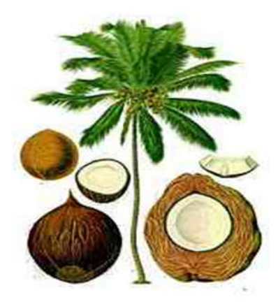
Plate IV: Coconut Tree