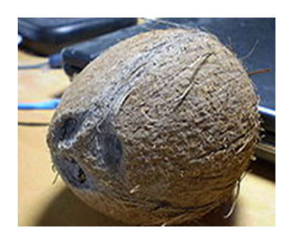
Plate V: An Unopened Coconut Fruit