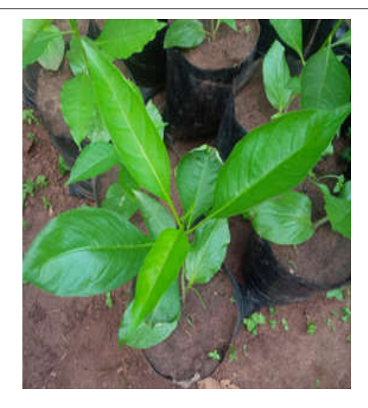
Plate 2a. Simple leaves of seedling

Adansonia digitata exhibited hypogeal germination and the trend was erratic. Initial leaves were simple, and compound leaves started appearing from the 7<sup>th</sup> week after germination. This means that A. digitata exhibited heteroblasticity (Plate 2ab). Germination commenced within two (2) weeks irrespective of the treatment continuing throughout the period of study. At the end of study the remaining seeds in the polythene pots were still in viable state and germinating. Germination percentages recorded were 73.3, 63.3, 61.6, 48.3, 38.3, and 33.3 for T<sub>4</sub>, T<sub>5</sub>, T<sub>3</sub>, T<sub>2</sub> T<sub>6</sub> and T<sub>1</sub> respectively. Germination commenced for T_1 , T_3 , and T_4 and two weeks after sowing; T_2 , three weeks after sowing; T_5 three weeks after sowing and T_6 seven weeks after sowing. The peak germination for T_5 was observed at 6^{\text{th}} - 7^{\text{th}} week; for T<sub>6</sub> at 8^{\text{th}} week; T<sub>4</sub> at 7^{\text{th}} week; T<sub>3</sub> at 8^{\text{th}} week, T<sub>2</sub> at 5^{\text{th}} week and T<sub>1</sub> at 9^{\text{th}} week. Some treatments had more than one peak. The Bulk of the germination was recorded between 5-8<sup>th</sup> week and 13-17<sup>th</sup> week (Fig.1). Values for the germination parameters are as shown on Table 1.