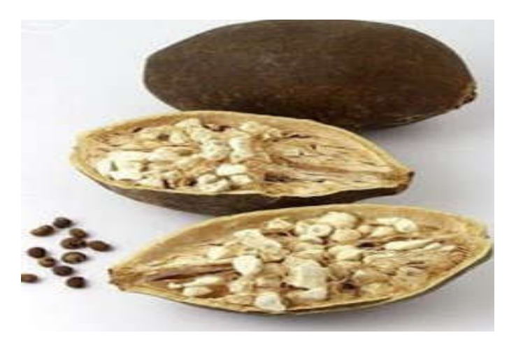
Plate 1a. Kapok of Adanasoniadigitata exposing pulp on seeds

Adansonia digitata commonly known as Baobab belongs to the family Malvaceae (formerly Bombacaceae). It is distributed through West, Central and East Africa and its habitat is the savannah. The baobab is a deciduous trees that grows up to 20m. It has a stout trunk which tapers abruptly and the bark is grayish. The leaves are compound digitata with 5-7 leaflets (Oboho, 2014). The pentamerous flowers are white, large and hang from stalks on pedicels up to 90cm long.