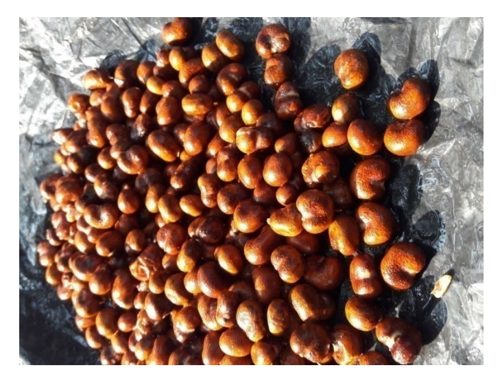
Plate 1b. Seeds of Adanasoniadigitata