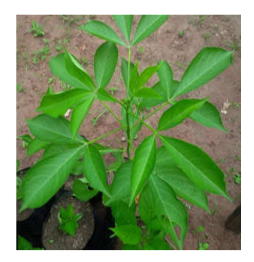
Plate 2b. Compound leaves of seedling