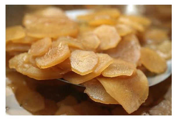
Fig. 6. Osmotic dehydrated Ginger Candy