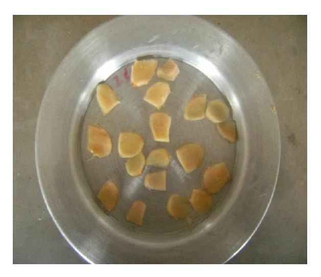
Fig. 2. Sliced Ginger