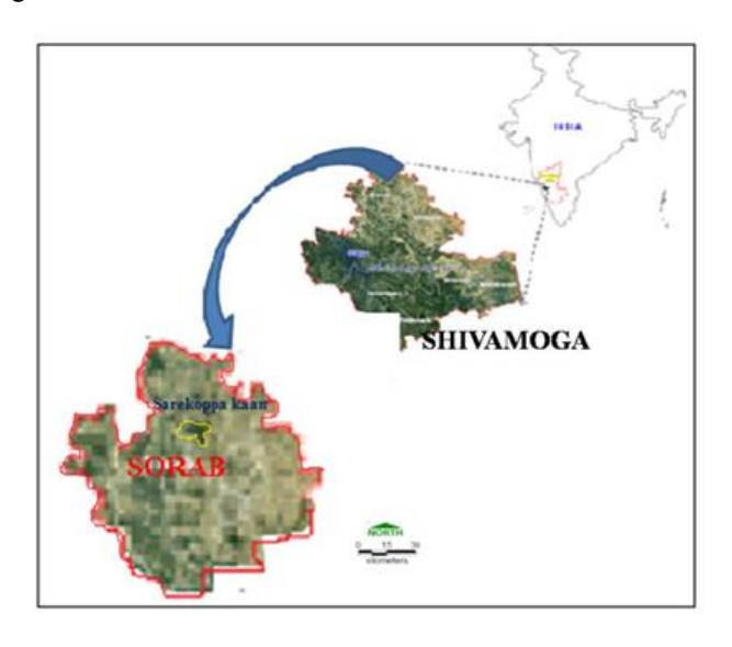
Figure 1. Map showing study site

Sarekoppa Kaan is situated in Sarekoppa village of Sorab taluk (Latitude 75.065163° N, Longitude 14.437860° E) which is located in between the border of Malnad (high forested area) and Deccan plateau. Village Sarekoppa is about 10 km from Sorab taluk on the way to Banavasi in Karnataka state (Fig 1.). The climate of study area is characterized by a monsoon regime. The southwest monsoon sets in this region around the first week of June and continues up to August or September. After a short gap, the northwest monsoon begins around October for a short period. The average rainfall of the study area ranges from 2,000–2,200 mm per year. To reach the village one must walk through the muddy road for about 5 Km from main road. Just 1 Km before reaching the village, we will enter a huge, dark green laden thick forest patch with sky high tree on either sides of the road.