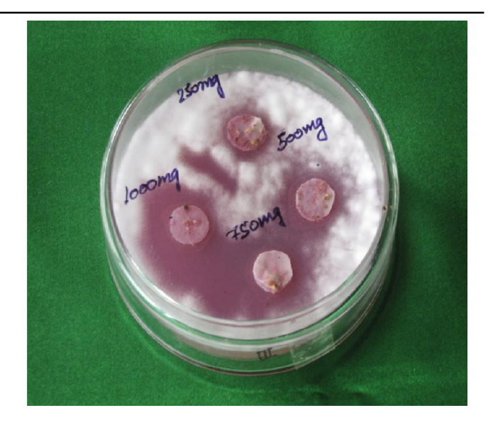
Plate 3. Antifungal activity of acetone extract of Syzygium aromaticum