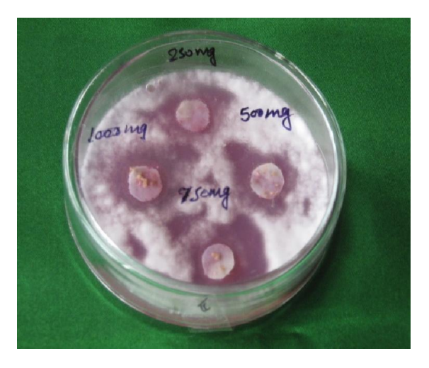
Plate 2. Antifungal activity of acetone extract of Piper nigrum