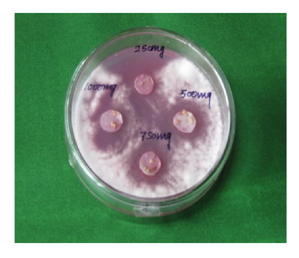
Plate 1. Antifungal activity of acetone extract of Curcuma longa